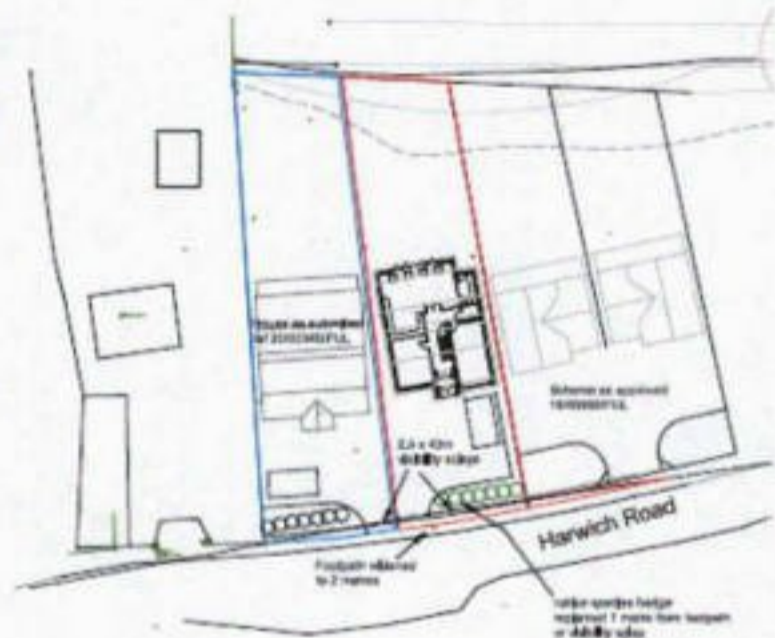
BLOCK PLAN (1:500)

PROPOSED NEW HOUSE HARWICH ROAD WEX ESSEX LOCATION & BLOCK PLANS